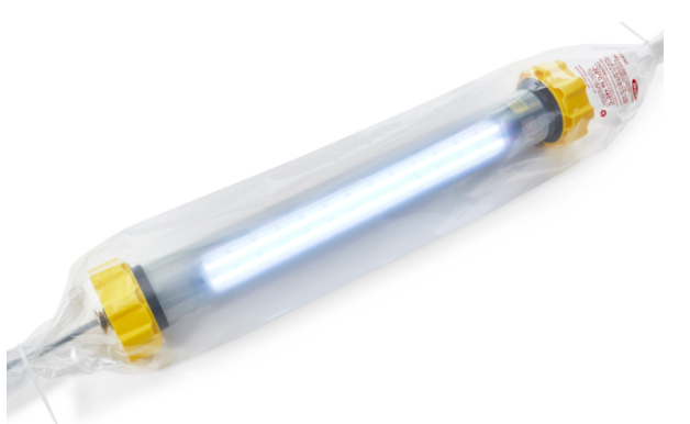
LX-621 Hazardous Area Certified Anti-Static Protection Bag