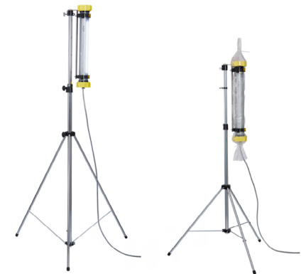
LL-668/35 & LL-699/18 Tripods with LL-670 Mounting Bracket

Wolf's tripods give a stable platform allowing the luminaire to be attached with the LL-670 Tripod Bracket Kit and used at a variety of heights and positions to deliver vertical or horizontal forward facing light, in the horizontal position the light can be directed upwards, illuminating the work area from the underside.