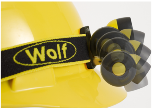
A tilt mechanism allows the beam to be directed where needed

VERSION: SL086 DF-593 ISSUE 5 WWW.WOLFSAFETY.COM