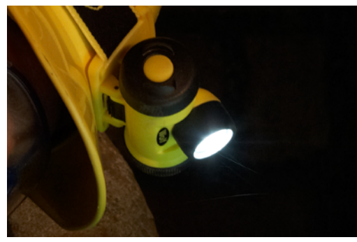
The HT-400Z0 allows hands free illumination