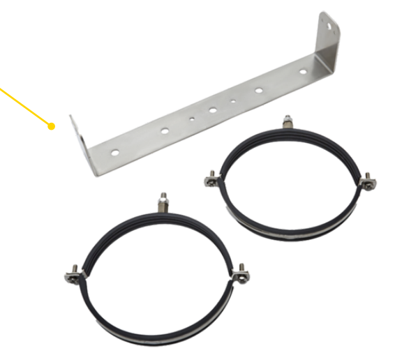
LFX-HPC Horizontal Pole Clamp Kit for ATEX Installed Floodlite

Vertical pole adaptor plate All required fixings