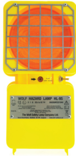
HL-95 Hazard Lamp